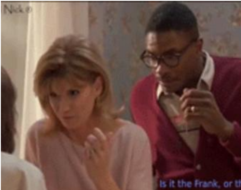
There's Something About Mary

Set pieces: use different points of view