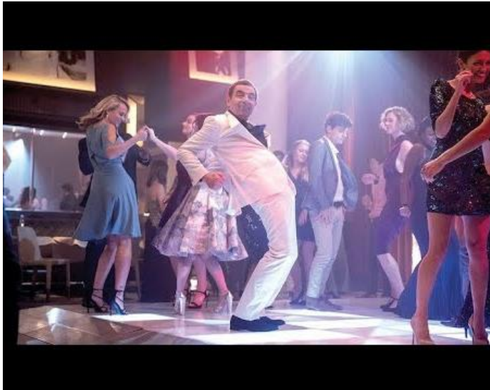
Johnny English Strikes Again

Set something up as a very obvious disaster waiting to happen