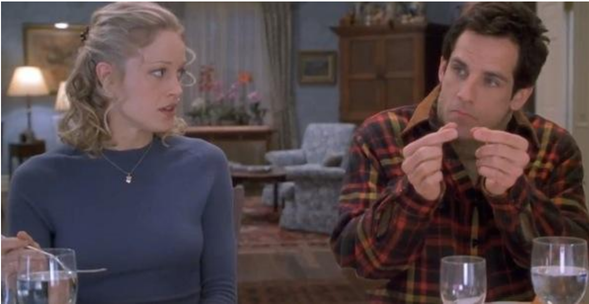
Meet the Parents

Set pieces: everyone acts true to their character